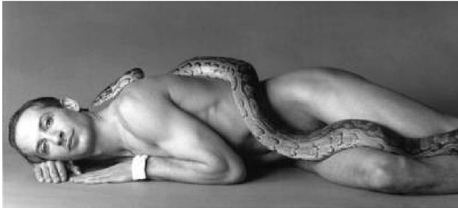
"AFTER AVEDON"; 21" x 30", by Chuck Samuels